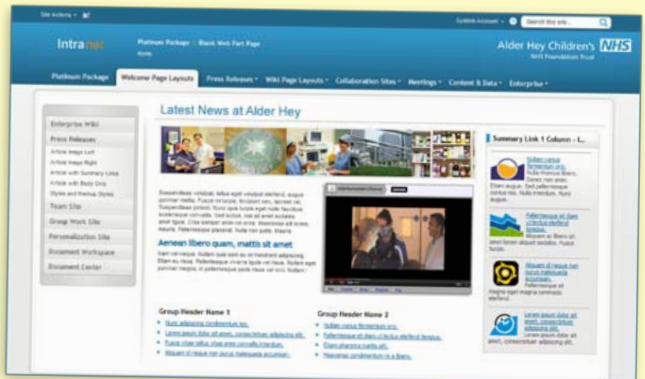
Example of how the new Intranet could look.

Information is still being gathered and as the project grows. The Intranet will become a great resource for both staff based at the hospital and in the community. Look out for your CBU pages in the new year and if you would like to provide feedback please email communications@alderhey.nhs.uk