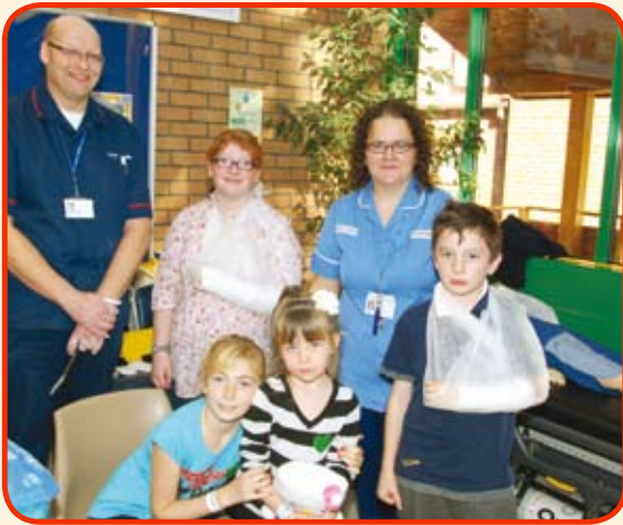
Staff demonstrate their plaster techniques with visitors of all ages.

generously contributed free food for the day!