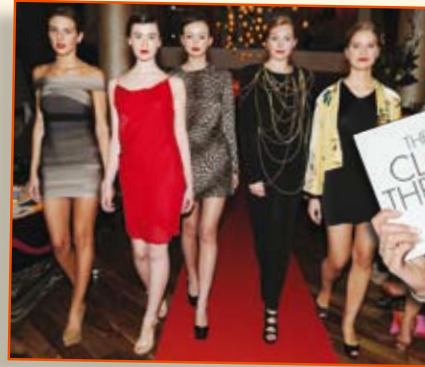
A selection of fabulous clothes donated for the Clothes Throw events.