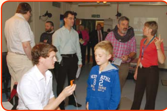
Visitors got the chance to try out Alder Hey's latest technology.

This year over 300 people attended our Alder Hey Annual Members' Meeting and Open Day. The day was incredibly successful thanks to the hard work and support of all staff involved.